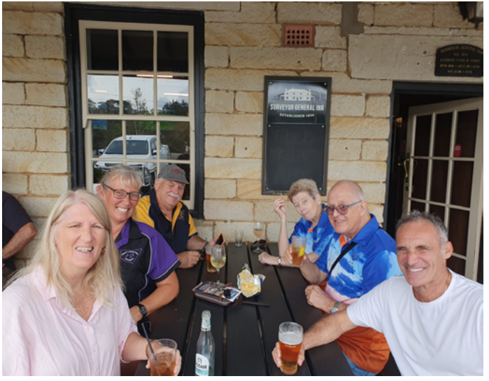
More photos of this trip can be found on the club Facebook Page.